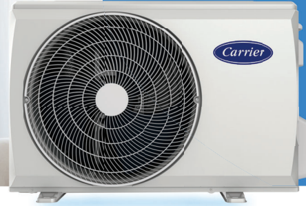
Condensing unit (18 & 24K models)

WIFI Control: Online control to have more functions.